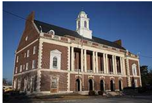
The United States District Court at 413 Middle Street.

In 1933, the Federal Government built the Post Office and Courthouse in New Bern with WPA funds of $325,000, making it one of the largest and most expensive buildings in North Carolina. This expenditure for a town the size of New Bern was controversial since the average post office at the time cost $50,000. Will Rogers satirized the situation in his column, "Please Pass the Pork." In July 1992, the Post Office vacated the building which is now the United States District Court.